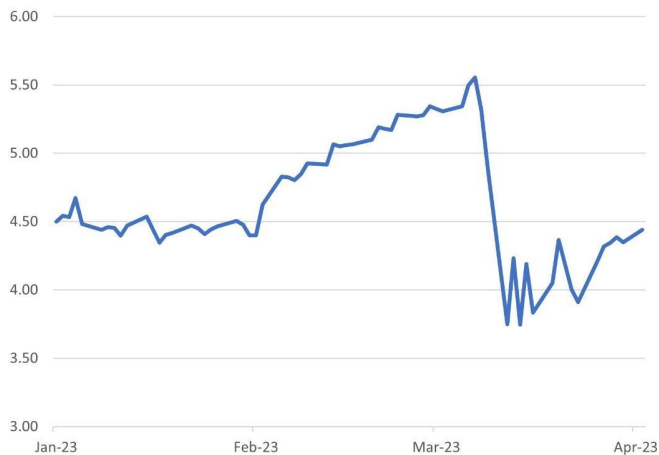
Chart 3: Market expectations for the level of Fed funds rate as of December 2023

US government bond yields also moved lower in anticipation that the Federal Reserve would cut interest rates before the year's end. The US money markets now price that the US Fed funds rate will be around the 4.25-4.50% level at the December meeting, compared with the implied interest rate of 5.5% in early March.