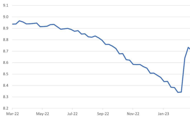
Chart 2: Size of the Federal Reserve balance sheet ($ Trillion)

The banking crisis that unfolded during the quarter led to a substantial intervention by the Fed in the form of quantitative easing. In essence, the Fed pumped billions of dollars into the system, reversing almost 60% of the previous quantitative tightening seen since May 2022. Quantitative tightening, whereby the Fed sells bonds in the market, was one of the factors that had previously pushed yields higher.